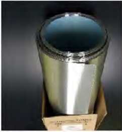
ITW INSULATION SYSTEM