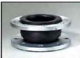
SINGLE SPHERE CONNECTION WITH FLANGE