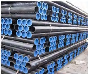
ERW . PIPE