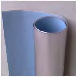
INSULATION JACKETING AND ACCESSORIES LTD

Brand: ITW INSULATION INC. PABCO Origin: UAE