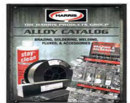
BRAZING ROD HARRIS