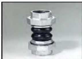
TWIN SPHERE CONNECTION WITH UNION