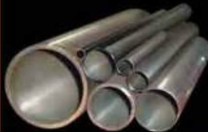
Seamless & ERW Pipes