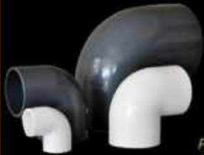
PVC and HPVC Pipes and Fittings