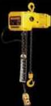
Chain Pulley block